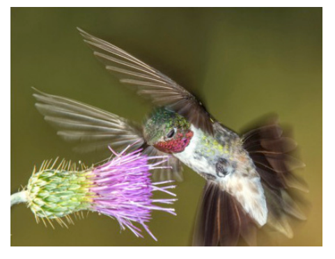
"Thistle Flower and Hummer" by Nirmal Khandan

There are several common methods used in macro photography. My macro images tend to be shot with a dedicated macro lens, a tripod and a focus rail, and then combined using "focus stacking" techniques in software. Other techniques involve