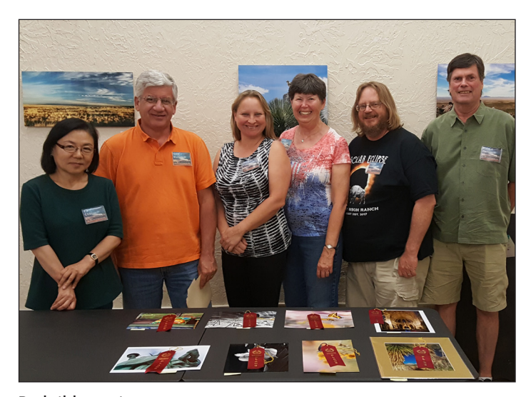
Red ribbon winners