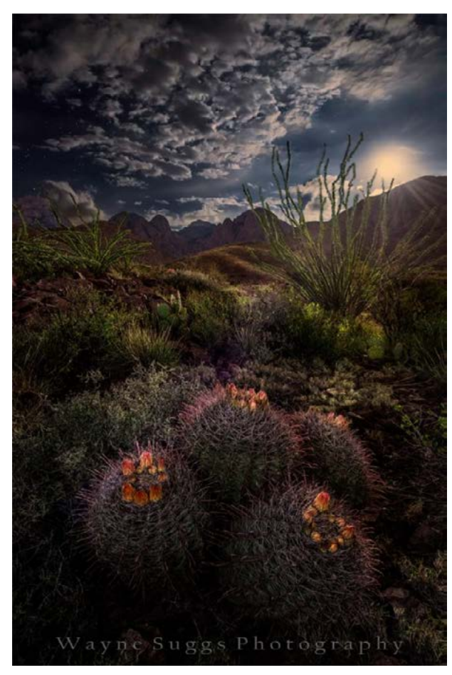
"Moonlight on the Barrels" by Wayne Suggs

"GETTING THE CAMERA OFF AUTO MODE" – This workshop will focus on participants getting the photograph they want by gaining an understanding of aperture priority and shutter priority settings on their camera, plus the value of both. The instructor will break down the exposure triangle (shutter speed, aperture, ISO) so participants can understand and use their relationship. Following that there will be small group hands-on time to help participants learn how to change these settings on their own camera. Participants will then go out into the downtown area to take photographs based on the exposure triangle, aperture and shutter speed presentations provided during the workshop. Members from the DAPC will be available for assistance during this practice session. Participants will return to the workshop environment for small group discussion and to provide a venue to answer questions