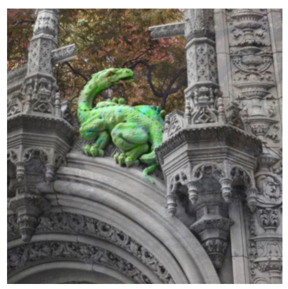
"ALT NYC" by Debbie Hands

extensive clone stamping, including Seth Madell's Return to Abbey Road. Compositing was also prominent, and Debbie Hands' African romp was an exceptional example.