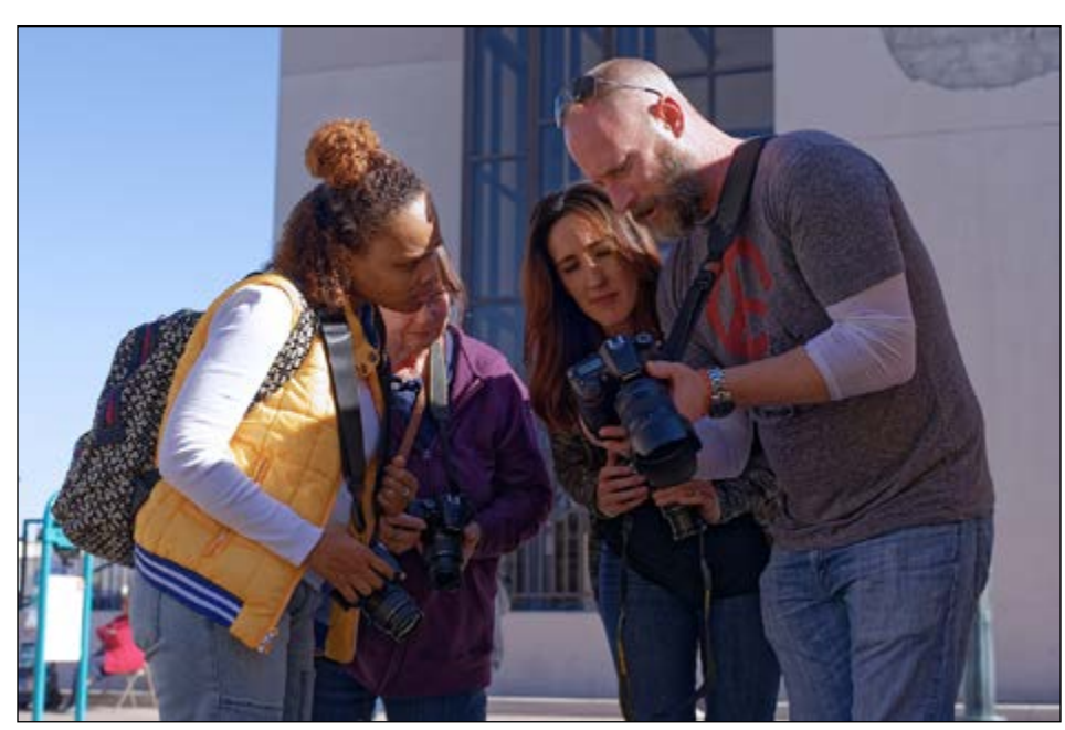
Learning Your Camera by Seth Madell

This workshop will focus on participants getting the photograph gaining they want by understanding of aperture priority and shutter priority settings on their camera, plus the value of both. The instructor will break down the exposure triangle (shutter speed, aperture, ISO) so participants can understand and use their relationship. Following that there will be small group hands-on time to help participants learn how to change these settings on their own camera. Participants will then go out into the downtown area to take photographs based on the exposure triangle, aperture and shutter speed presentations provided during the workshop. Members from the DAPC will be available during for assistance. Participants will return to the workshop environment for small group discussion and to provide a venue to answer questions