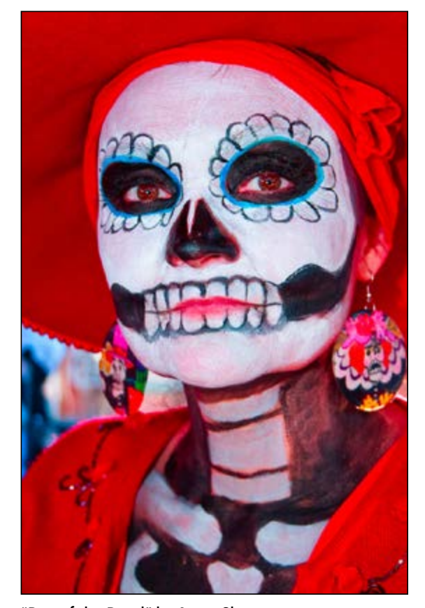
"Day of the Dead" by Anne Chase

Next month's theme is Love. Members should submit up to three images using the