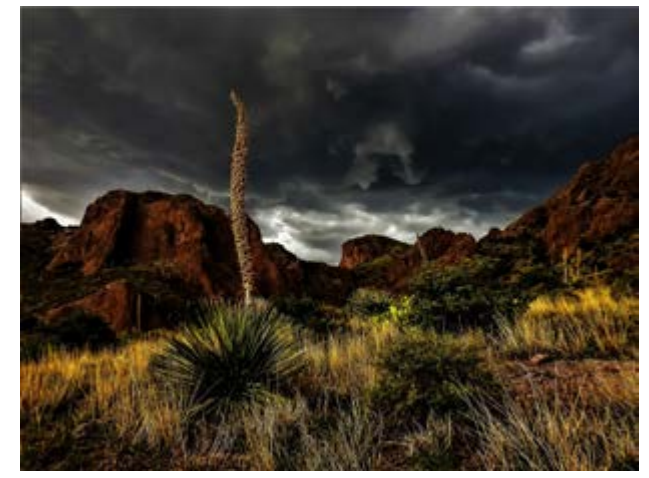
"The Calm before the Storm" by Gerald Guss (color, B)