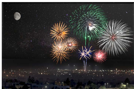
"Fire in the Sky" by Seth Madell