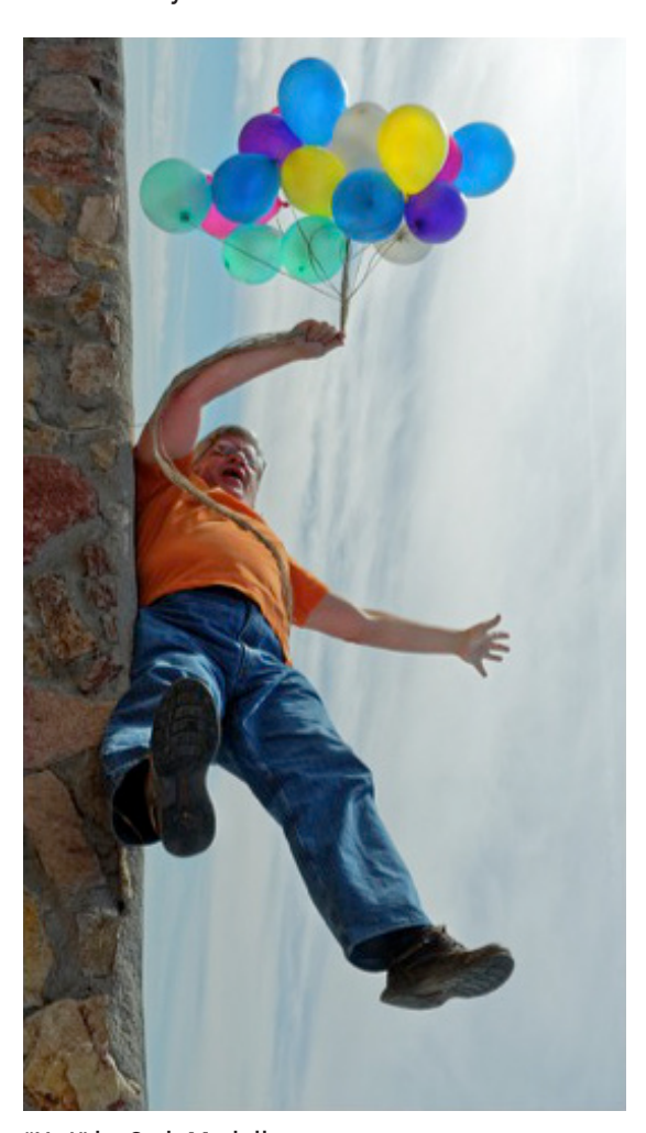
"Up!" by Seth Madell