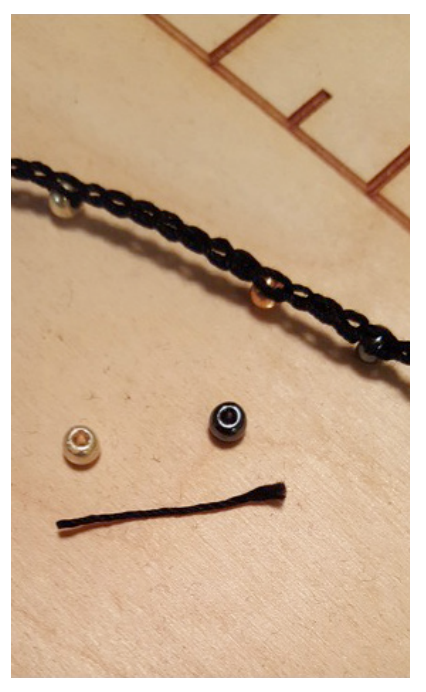
"Faces in Places" by Rachel Courtney

Next month's theme is Landscapes . Submit up to three of your best landscape shots by sending them to Kristi